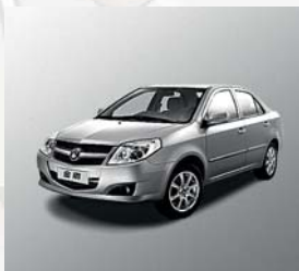
GEELY MK W06180F