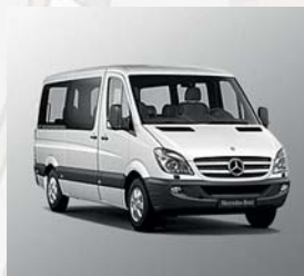
MERCEDES SPRINTER II C 2006 W09240A9