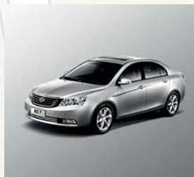
GEELY EMGRAND/ VISION W02210J