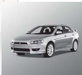
MITSUBISHI LANCER X (1.5) W21200G