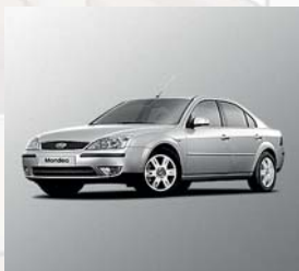
FORD MONDEO III (1.8-2.0) W05240G9