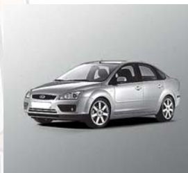
FOCUS II (2.0) W01228E9