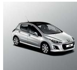
PEUGEOT 308 (1.4-1.6 16V, VTI) W03228J