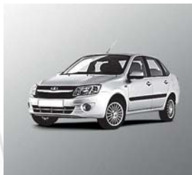
LADA GRANTA W22200J