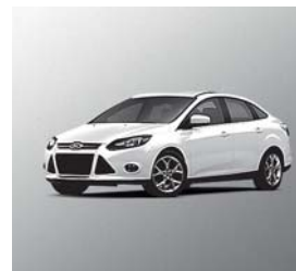
FOCUS III, MONDEO IV (1.6) W02225B9