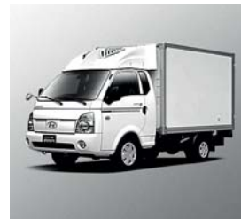
HYUNDAI PORTER II W01255B9